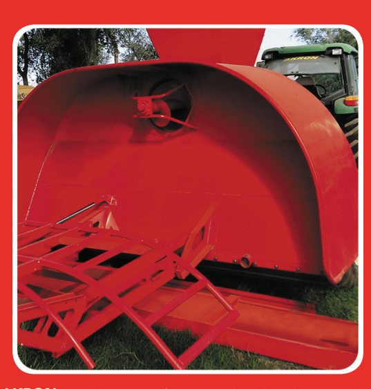
AKRON may change specifications and product designs in this or other brochures at any time, without previous notice. Images are for illustrative purposes only.

Our hydraulic pan offers the simplest and fastest way to load bags!